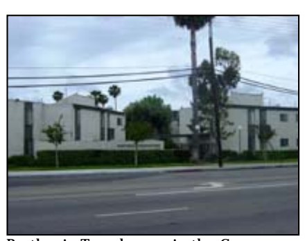
Parthenia Townhomes in the Canoga Park

Now we go to Canoga Park , a family complex insured under Section 221(d)(4) of the National Housing Act. The complex contains 12 two-bedroom and two three-bedroom apartments. It received a REAC physical inspection score of 98c in 2003. It's owned by Young Israel, a profit motivated owner, and managed by AIMCO.