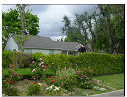
White Oak Group Home