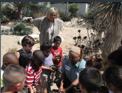
Youth enjoy learning about the garden at Carmelitos