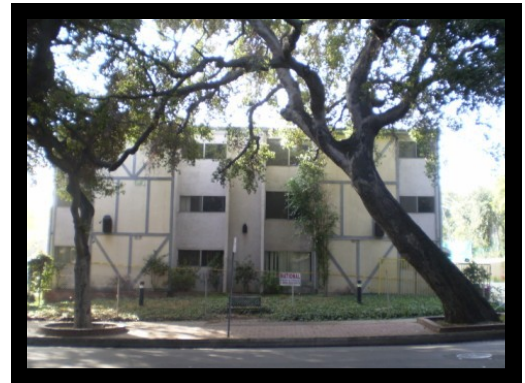
Hudson Oaks before modernization

The building uses Section 8 Housing Choice Project Based Vouchers administered by the Pasadena Housing Authority. The program is committed to serving 20 vulnerable homeless people. The building provides case management, benefit assistance, health, nutrition and wellness workshops, social activities, financial education, and a gardening club.