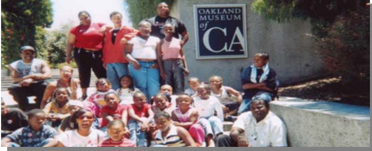
Young residents of Monterey Pines on an educational field trip.

When a coordinator is equipped with a good resource directory, meeting the needs of residents can be achieved with great efficiency and precision. And the more localized the directory, the more relevant it is to your clientele. Good sources of such directories are: the United Way, Junior League, area agencies on aging, Councils on Aging, religious organizations, local hospitals, community centers, and other SCs.