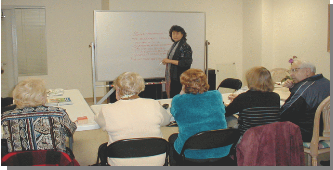
ESL classes at Steamboat Apartments, San Francisco