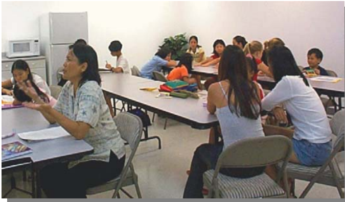
Kukui Towers After School Program

Kukui Tower is located in a district of Honolulu, HI that has been plagued by drugs and crime. Most of the residents of the 380-unit property are immigrants who are unemployed or work in low paying jobs. The average income is just $7,911. In many cases they have difficulty reading, writing and speaking English, have little formal education and are unaware of existing social service programs and how to access them. Unfortunately, this is common in many low-income projects; yet, it is also an environment that can substantially benefit from a social service coordinator.