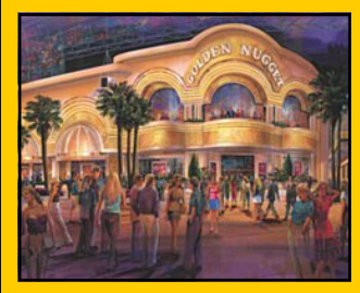
Stay Tuned for More Detailed Information on Reservations