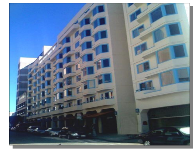
Cetrice Polite Apartment

The nine story facility was developed by TODCO (Tenants and Owners Development Corporation) Group. This project was initially built in 1983 with HUD's Section 202 Direct Loan funding. The project has a Section 8 project-based HAP contract for all 91 units. In 2006, through Red Mortgage Capital, new HUD/FHA Section 221(d)(4) mortgage insurance was utilized, in conjunction with tax exempt bonds and Low Income Housing Tax Credits to rehabilitate the facility. The scope of work included new roofing, alarm system, laundry equipment, carpeting, kitchens, bathroom upgrades, accessibility improvements and refurbishment of the elevators.