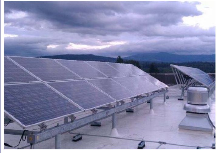
Solar array on the roof of Lincoln Square