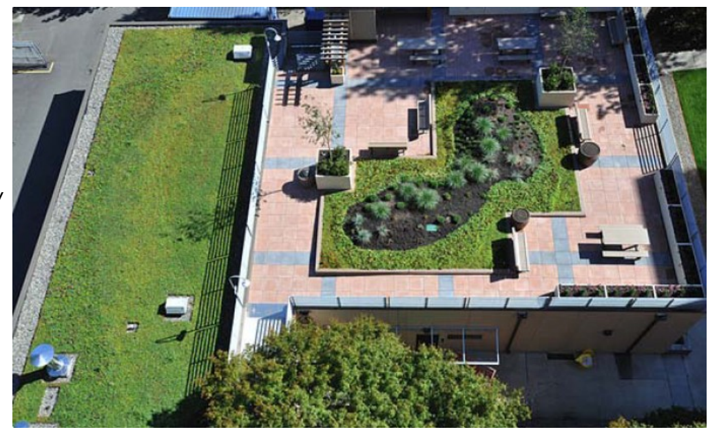
Completed green roof at Lincoln Square

To truly promote and document the savings resulting from these renovations, BHA has partnered with the Whatcom County Community Energy Challenge to track gas emissions, waste reduction and energy use before and after the renovations. Other partners in these projects include Dawson Construction, RMC Architects, 360 Analytics, and Sustainable Connections.