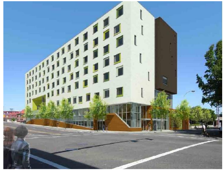
Conceptual design by Holst Architecture—View from Broadway and Hoyt

individuals who need assistance with housing, employment and treatment counseling, hot showers, storage, and communication services to help with their search for employment and permanent housing. In addition, during a period when numerous construction projects have stalled, building the Center will create approximately 125 jobs in the construction trades industry.