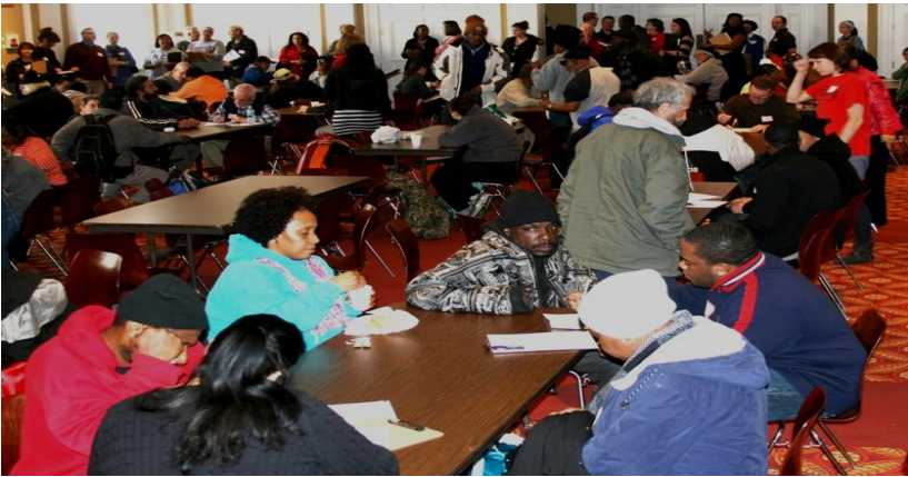
Left, the downtown Richmond Winter 2012 Point-in-Time count in full swing on January 26 at historic St. Paul's Episcopal Church.