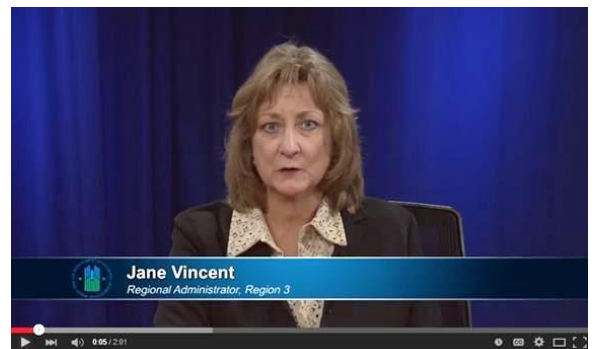
June is National Homeownership Month