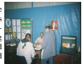
Pathways Homebuyer Fair

vide guidance for persons with disabilities, housing providers, and building and design professionals to ensure that our programs are accessible to everyone.