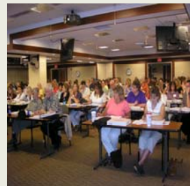
DE Underwriting Training