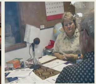
Radio interview in Riverton

Forum to educate immigrant advocates, beneficiaries, social service, education and health care providers about HUD housing programs. To make the home buying process less complicated, our office continued working with our state housing counseling task force. We provided training and attended quarterly meetings.