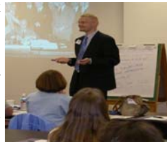
Money Smart Train-the Trainer workshop

Faith-based organizations and other grassroots groups provide the public important services. HUD wants to increase their involvement in our programs with educational seminars, technical assistance and by working closely with them. As the federal liaison to the Governor's Advisory Board on Faith Initiatives, we participated in several events throughout the year to conduct outreach to inform potential partners on HUD opportunities. Wyoming Faith Initiatives received a continuing Compassionate Capital Fund grant. We partnered with Federal Deposit Insurance Corp (FDIC) to hold a Money Smart