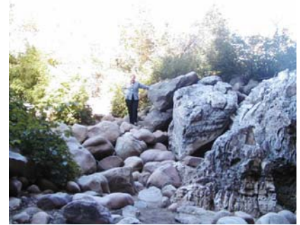
Debbie Wilson, Vice-Pres. of WY Assn of Housing & Redevelopment (WAHR) was our guide on our trip to the Wind River Reservation.

Our staff participated in several internal and external trainings for our personal enrichment, program knowledge and to maintain high individual performance. Our office visited the Wind River Reservation to meet some of our partners and to improve communication and employee involvement. We collaborated with our regional office on focus group sessions to solicit input on our customer service. As a result, we developed and implemented a customer service plan in order to increase customer satisfaction. To improve internal communications, our staff is involved in decisions on planning and developing a workable management plan.