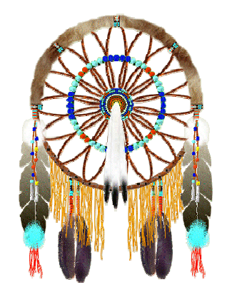
Casper Office Mission: Bringing HUD and Wyoming community resources together to encourage growth and promote opportunities.