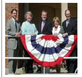
Johnson City Board of Commissioners

http://www.ci.springfield.or.us/dsd/Planning/IMAGES/EfficiencyMeasures_Final% 20Combined_1_7_08.pdf