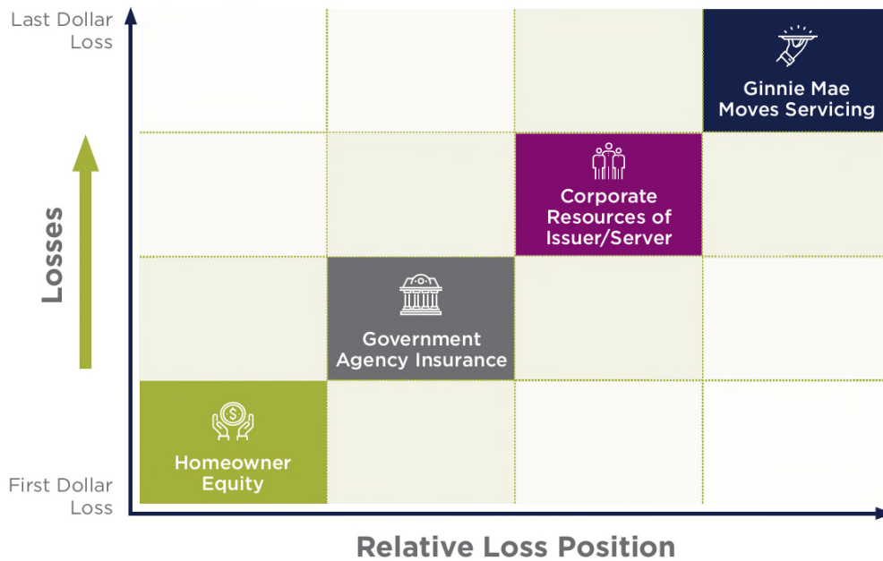
Figure 1: Protecting the Ginnie Mae Guarantee

The Ginnie Mae guarantee, coupled with an expected return higher than U.S. Treasury securities, makes Ginnie Mae securities highly liquid and attractive to domestic and foreign investors of all types. This liquidity is passed on to the issuers who can then use the proceeds from issuances to make new loans available. The ongoing cycle (as depicted in Figure 2) helps support accessible and affordable housing for America. Because the Ginnie Mae guaranteed MBS are backed by the full faith and credit of the U.S. Government, capital continues to flow even during recessionary periods when liquidity stalls in the private market and in times of great market change – ensuring that mortgage financing is available for homeownership and rental properties regardless of the economic climate. In 2020, over 2.8 million homeowners and renters benefitted from the Ginnie Mae MBS program.