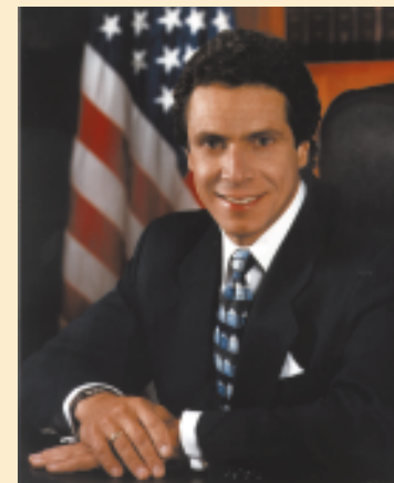
Andrew Cuomo, Secretary Department of Housing and Urban Development