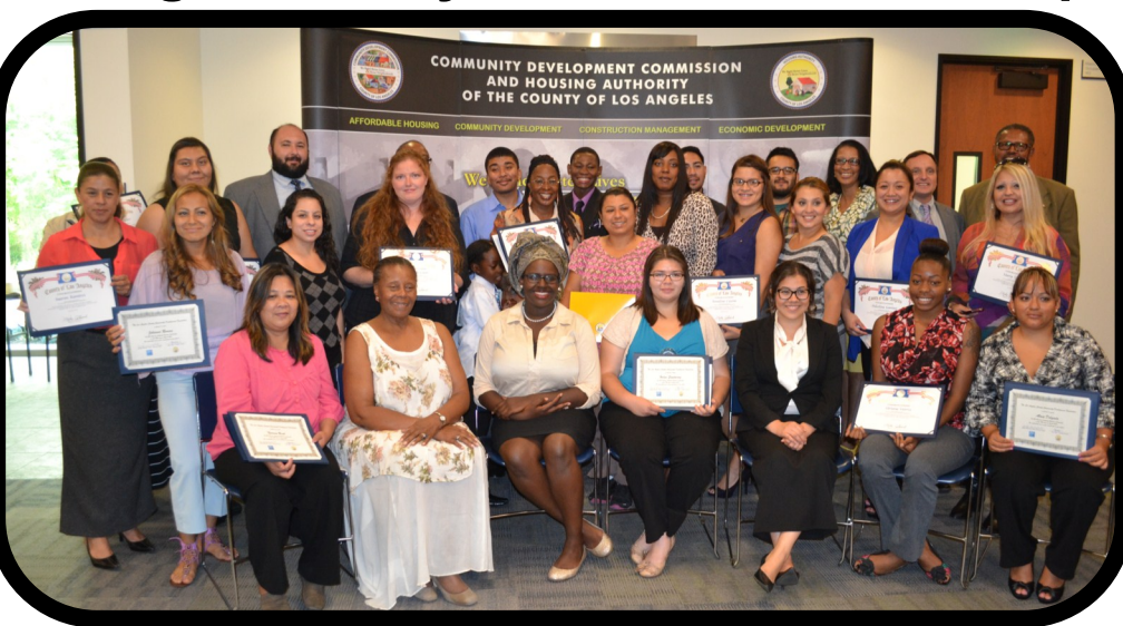
Scholarship awardees celebrate along with HACoLA and HUD Staff

The Community Development Foundation (CDF) awarded over $25,000 in scholarship funds to HACoLA's public housing residents and Section 8 partic-