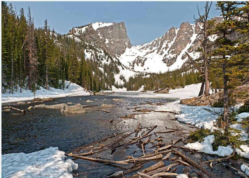
SERVING COLORADO, MONTANA, UTAH, WYOMING, NORTH &amp; SOUTH DAKOTA