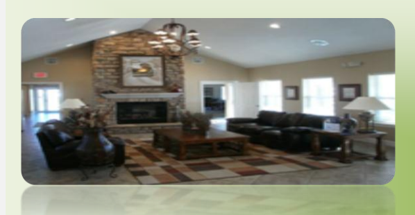
To qualify for residency at Maple Grove Villas, total household income must be below certain income guidelines, based on the number of people living in the townhome. For further information about this apartment complex, please visit: http://www.liveatmaplegrove.com/

On January 8, 2013, the Des Moines Multifamily Program Center closed a loan worth more than $11 million for Maple Grove Villas. Through refinancing, ownership of the complex was able to restructure their debt allowing for physical and financial viability in the future. Maple Grove Villas are two and three bedroom townhomes located in West Des Moines consisting of 240 pet friendly units. The complex offers a wide array of amenities including: fitness center, swimming pool, business center, garages, and access to high speed internet.