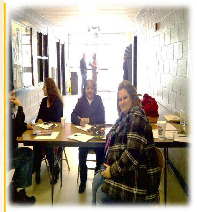
Volunteers at the Willa Gill Center for the WHSC 2013 Point-in-time Count

At the end of the cold January day, 40 surveys were completed to add to the total collected in the rest of the area served by the local Continuum of Care (the overall data is still being analyzed). Many thanks to Tom and all who volunteered!