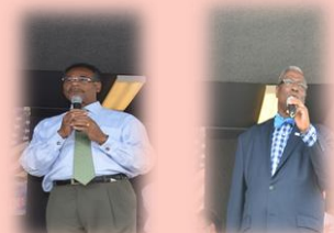
Congressman Emanuel Cleaver and; Mayor Sly James welcome veterans to the Stand Down.

On June 6 -7, 2014, Congressman Emanuel Cleaver II and Kansas City, MO Mayor Sly James welcomed veterans from across the Kansas City metro area to the 21 st Heart of America Stand Down held at the Scottish Rite Temple, in Kansas City, MO. Almost 100 private, non-profit, government, and faith-based organizations came together to provide resources in a safe, substance free environment to many veterans who are battling homelessness.