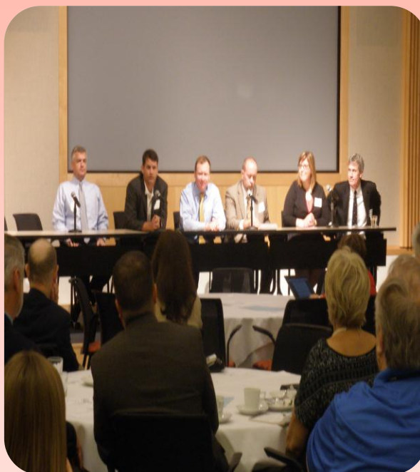
Presenters discuss corridor plans with workshop participants.

After the presentations, participants had an opportunity to ask questions and to join in the discussions of what the future of sustainable development can look like in communities surrounding the Kansas City metro area.