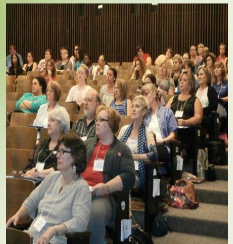
Participants at the Iowa Peer to Peer Homeless Symposium

http://portal.hud.gov/hudportal/HUD?src=/program_offices/comm_planning/homeless