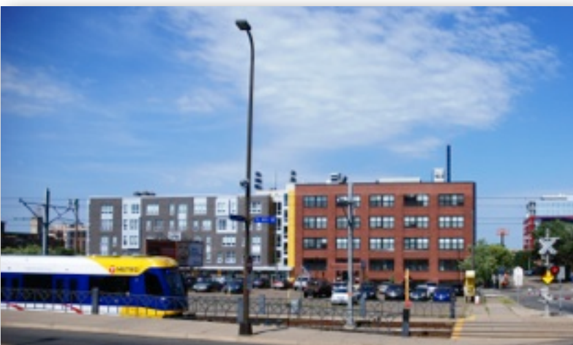
Street view of Emanuel Housing from the Hiawatha Light Rail Line

Support services at Emanuel Housing include a 24 hour staffed front desk, case management, peer groups, onsite recovery groups, and part time onsite employment services.