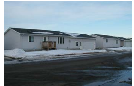
HAPI affordable housing development in Aberdeen

Homes Are Possible, Inc. (HAPI), of Aberdeen has become the newest nonprofit to be approved by HUD as a provider of secondary financing. HAPI provides grants of up to $4,000 to eligible low-income families to assist with down payments, closing costs, and home improvements. The organization recently gave away its $1 millionth dollar in assistance. They gained their HUD approval to provide secondary financing on FHA loans in June.