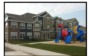
Brandon Heights Apartments

The Low Income Housing Tax Credit ( LIHTC ) Program was designed as an incentive for construction and rehabilitation of housing for low-income households. Developers of housing tax credit projects typically raise equity capital for their projects by syndicating the tax credits to investors who are willing to invest in the project. SDHDA has $2.8 million available for the 2015 application round.