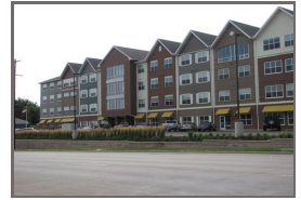
Pettigrew Heights Apartments Sioux Falls - 2012

SDHDA announced $4.6 million in funding is available from the HOME Investment Partnerships Program. HOME funding provides financing for developers and owners for acquisition, new construction and rehabilitation of affordable housing.