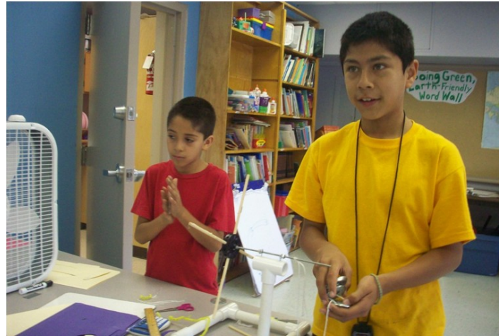
Youth residents of Hillsdale Terrace constructing and testing model wind turbines with community partner YWCA Learn Links.

The Housing Authority of Portland's Hillsdale Terrace, a 59-unit, family-oriented public housing apartment community, sits nestled in a shady basin surrounded by tidy, middle class neighborhoods. Isolated in many ways from their more well-to-do neighbors, children living in the Terrace sometimes miss out on the exposure to new ideas and enrichment activities available to their peers that are so critical to individual growth and development.