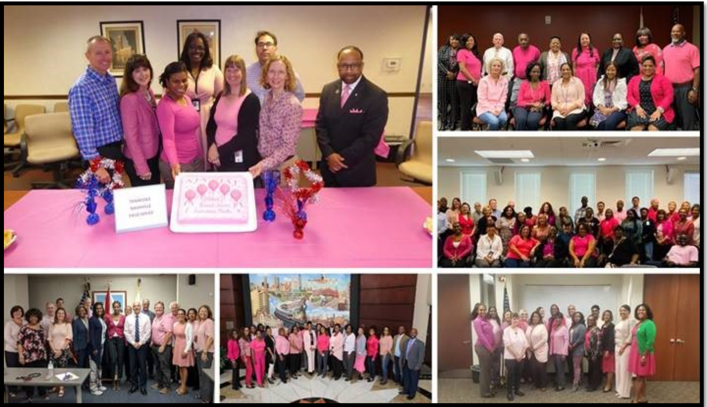
Pictured: Employees throughout region four wear pink to increase breast cancer awareness. Top Left: Nashville Field Office, Top right: Mississippi Field Office, Middle right: Jacksonville Field Office, Bottom right: Greensboro Field Office, Middle bottom: Atlanta Regional Office, Bottom left: Miami Field Office.

Region four recognized Breast Cancer Awareness Month as offices throughout the Southeast wore pink to increase awareness. In 2019, an estimated 268,600 new cases of invasive breast cancer are expected to be diagnosed in women in the U.S., along with 62,930 new cases of non-invasive breast cancer. About 2,670 new cases of invasive breast cancer are expected to be diagnosed in men in 2019. A man's lifetime risk of breast cancer is about 1 in 883.