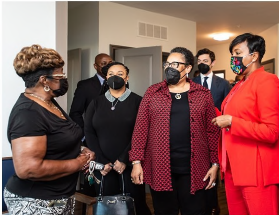
HUD Secretary Marcia L. Fudge and Atlanta Mayor Keisha Lance Bottoms speak with a resident at the senior living community Herndon Square in Atlanta, Georgia.

HUD Secretary Marcia L. Fudge visited the City of Atlanta on September 27, 2021 to amplify housing investment of construction, rehabilitation, economic development, and community revitalization.