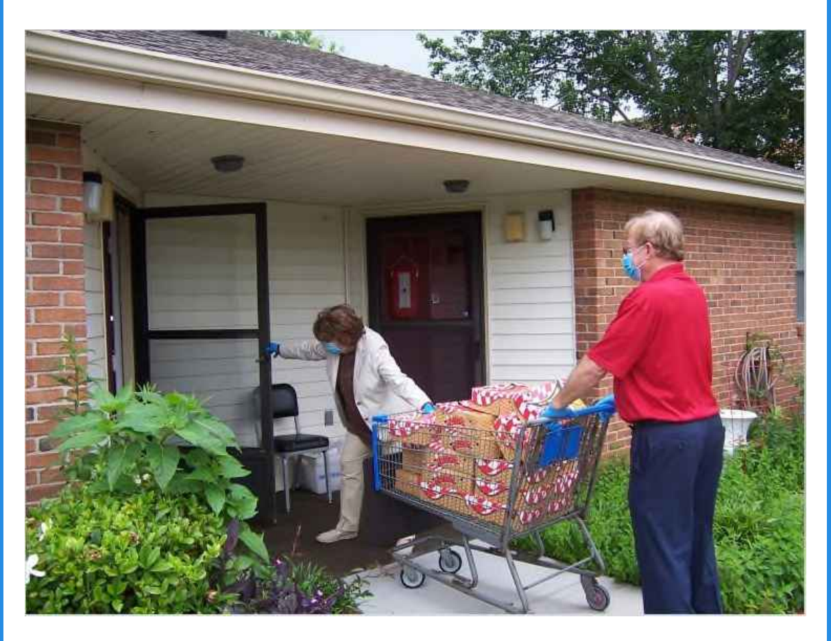
Asbury Arms management team delivers meals to residents during COVID-19.

The HUD Neighborhood Network Resource Center in the Community Center at Asbury Arms recently restarted events after being shuttered during the COVID-19 pandemic. Asbury Arms is a HUD 202 property located in West Columbia, South Carolina and has been a home for seniors and disabled since 1985. The District