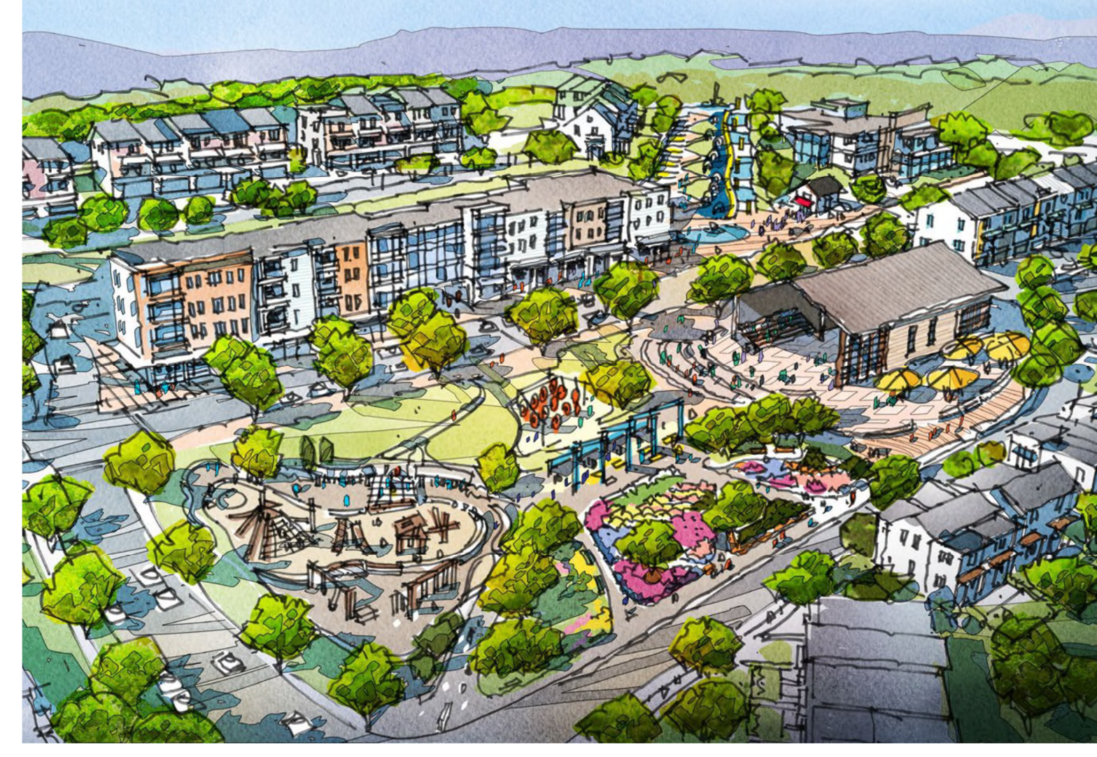
Pictured: A rendering imagines the destination public park and Anchor Building at the center of the new Western Heights development. The Anchor Building will serve as an arts and maker space, providing a backdrop for an outdoor performance area.

Finally, the People Plan encompasses the following strategies: connect residents to the education and training needed for living wage jobs in demand occupations; connect residents to accessible primary care providers to promote continuity care and wellness; ensure every child has access to a high-quality early education program; support schools in enhancing rigor to help students gain proficiency in core academic subjects; and coordinate afterschool programs to align content and tutoring with school instruction. Over 90 partners have committed investments and resources to coordinate these supportive services for residents.