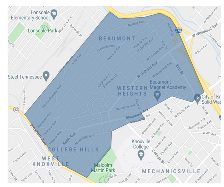
Pictured: Western Heights Addition, a physically obsolete public housing property, will be replaced with high-quality mixed-income housing designed with residents preferences in mind (left); the boundaries of the Western Heights Choice Neighborhood (right).