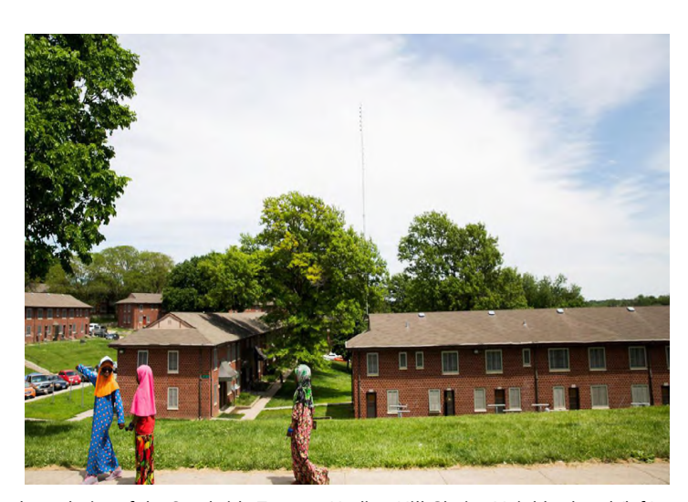
Pictured: The boundaries of the Southside Terrace / Indian Hill Choice Neighborhood (left); Southside Terrace Garden Apartments today (right).

To ensure all families have a place to call home, OHA and their development partner Brinshore will oversee a Housing Plan centered on the redevelopment of Southside Terrace. The seven phase Housing Plan was developed with a diverse targeted program of household sizes and types for existing residents, while integrating affordable and market rate housing. The overall Housing Plan will include 746 new mixed-income units, providing a one-for-one replacement of the 358 public housing units, additional affordable units, and market rate units. The new mixed-income housing will be developed on the original Southside Terrace site, as well as off-site locations in and outside of the neighborhood to offer residents a wide variety of housing choices. The Housing Plan incorporates design elements, amenities, and architectural characteristics attractive to all income levels, with thoughtful integration and convenient access to various new neighborhood facilities.