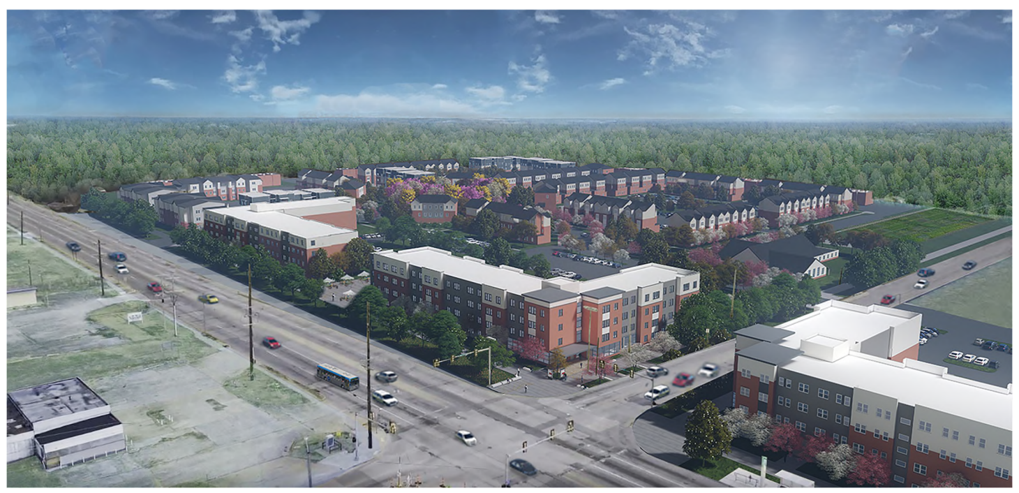
Pictured: The new Comanche Park Apartments site is reimagined, offering families a variety of choices from mixed-use buildings to garden apartments to townhomes. These new units will be high-quality and mixed-income to attract economically diverse households to the neighborhood.

Further, the plan seeks to enhance existing parks and open spaces to activate unused land, promote healthy activities and connect to the larger greenway network in north Tulsa. A new Urban Wilderness area with amenities such as nature trails, ponds, and picnic areas will also be created, connecting the area to the broader Osage Prairie Trail System.