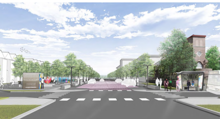
Pictured: New streets are imagined throughout the Indian Hill neighborhood as Choice Neighborhoods housing activities serve as a catalyst for greater neighborhood revitalization and investment.

Meanwhile, Canopy South will continue to engage local developers and leverage funds for additional housing development throughout the Choice Neighborhood. To further support the Indian Hill neighborhood, the City and OHA will invest in the homes surrounding Southside Terrace to support neighborhood residents. Grant funds will also be used for physical improvements to local businesses and other physical improvements to beautify the Indian Hill area. The City, OHA, and Canopy South developed a comprehensive strategy to support residents along the way. The People Plan strategies will focus on improving access and the quality of education, healthcare, and employment outcomes.