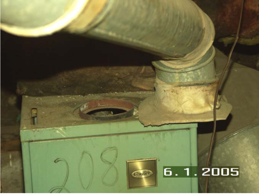
Furnace exhaust not ventilating to exterior of building.

Location: Holiday 101-B, 106 Commonwealth