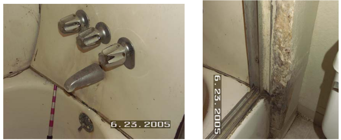
Tub wall separating and deteriorating