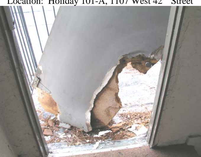
Location: Holiday 101-A, 1107 West 42<sup>nd</sup> Street

In addition, our earlier cursory review of Holiday Apartments building exteriors in March 2005 identified several significant problems, such as a deteriorated egress door, exposed electrical wiring, missing fire extinguisher, loose railing, rotted window frames, etc.